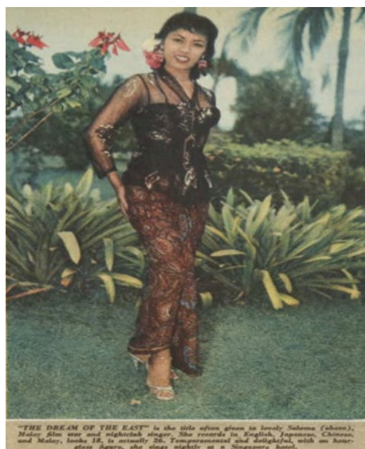
Figure 11: The Australian Women Weekly magazine stated that Saloma was a main attraction for visitors in Singapore and Malaya

Other than the British newspapers, a magazine from Australia, The Australian Women Weekly , had in 1959 published a report on Saloma in its Holiday in Malaya and Singapore segment. Saloma was touted as “ The Dream of The East ” (Figure 11). The magazine had introduced Saloma as a singer from Malaya, one with a beautiful voice, and a night club performer who was able to sing songs in various languages such as English, Japanese, Chinese and, of course, Malay. Based on the report published by the magazine, it is understood that Saloma was projected as a popular icon. She was seen as the unofficial tourism ambassador of Malaya and Singapore as her persona had successfully attracted tourists from Australia to come to Malaya and Singapore for a holiday. This indicates that other countries had acknowledged Saloma as one of the priceless attractions of Malaya. Hence, she was recognised as being capable of attracting foreign tourists to visit Malaya. Thus, it is evident that Saloma had contributed immensely to the tourism industry in Malaya at the time despite Malaya still being in the infancy of its independence in 1959 ( The Australian Women Weekly , 1959).