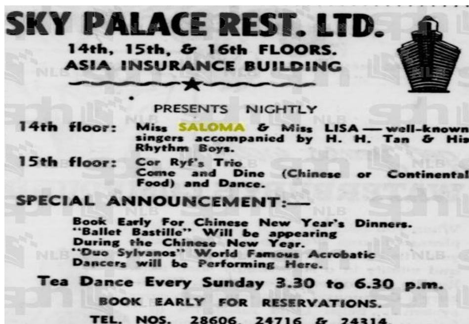
Figure 9: Salmah binti Ismail (Saloma) performance advertisement in The Straits Times , 1957