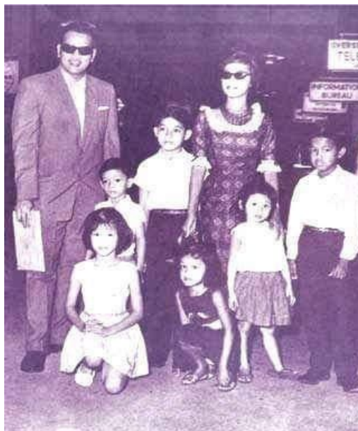
Figure 22: Saloma has introduced popular culture through modern Malay fashion during the past that remains until today

Clearly, the fashion designs as discussed in this paper had given shape to a more modern, stylish and trendy lifestyle for Saloma. Indeed, her lifestyle was modern and quite westernised. This was because Saloma was influenced by imperialism of culture and this brought about a huge impact at the height of her glory. It was seen that Saloma’s lifestyle was very progressive. The media in Malaya had often published images of Saloma who frequently wore sexy outfits similar to western artistes at the time. It was undeniable that the lifestyle practised by Saloma ran contrary to the norms practiced by the Malays who lived in in Malaya during the time. Her appearance in modern clothing, as seen in films and magazines, were regarded as immoral in the eyes of the Malays in Malaya at the time. This ultimately led to the local communities making the assumption that artistes like Saloma were immoral for not setting a good example for society (Hussin, 2004).