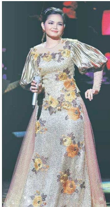
Figure 19: Dato' Sri Siti Nurhaliza wore a dress inspired by Citarasa Saloma (Saloma Taste) during her performance of Konsert Istana Cinta, Nostalgia Tan Sri P. Ramlee & Puan Sri Saloma in 2017

Saloma was also daring enough to parade a fruit headwear (Figure 21) as was worn by Carmen Miranda in the film “The Gang’s All Here,” (1943) (Figure 20) (Mandrell, 2001). This costume was used in the film “ Saudagar Minyak Urat ” (1959). Aside from colour-block fashion, Saloma also created a unique fashion to display a 21-inch waist and exposing the top half of the chest. The peplum (tapered skirts) design, side-split skirts, and tight kebaya were introduced by her between the 1950s and the 1960s, which incorporated both eastern and western characteristics.