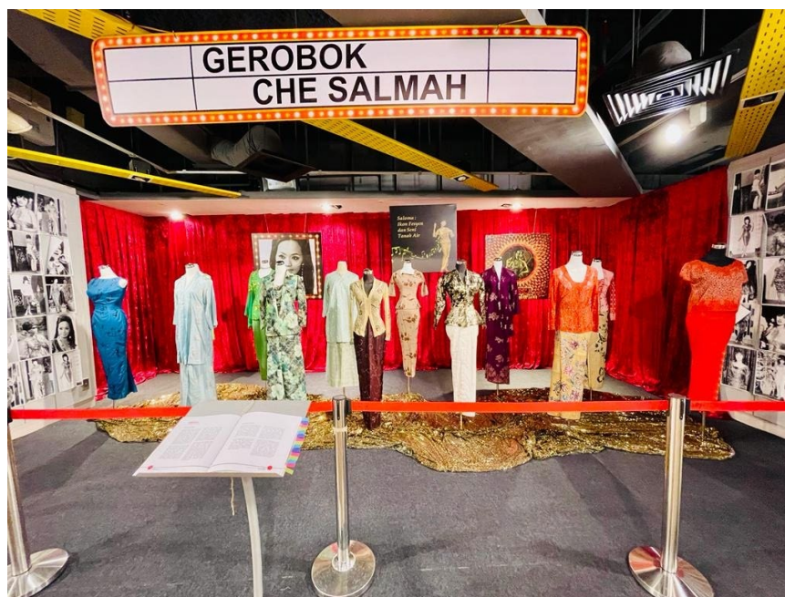
Figure 17: "Malayan Fashion Pioneer" and "Retro Fashion Icon" by Saloma had been on display at P. Ramlee and Saloma Aku, Dia dan Lagu Exhibition, Fahrenheit88 Mall, April-July 2022

Saloma was also seen to have made alterations and injected the local fashion couture such as kebaya with western elements. This was clearly the case with the Tight Contemporary Kebaya, seen as her main choice of apparel at the time. It is generally known that the kebaya is a traditional wear that reflects features of Malay women's fashion in Malaya, which had evolved in stages. If the history of the kebaya is to be examined, it can be seen that this item