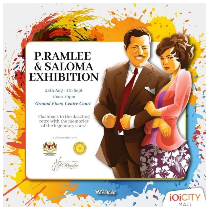
Figure 3: P. Ramlee & Saloma Exhibition at the IOI City Mall, August-September 2022