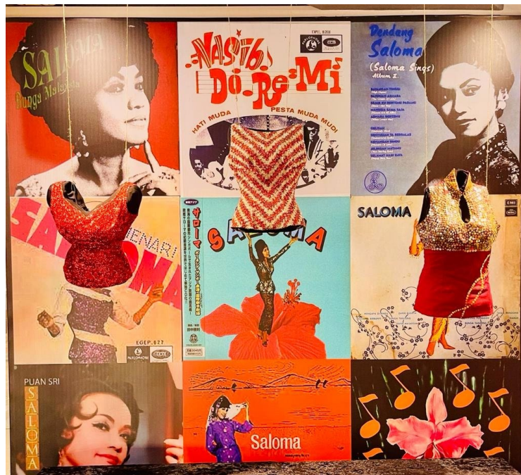
Figure 16: The blouse belonged to Saloma had been on display at P. Ramlee and Saloma Aku, Dia dan Lagu Exhibition, Fahrenheit88 Mall, April-July 2022