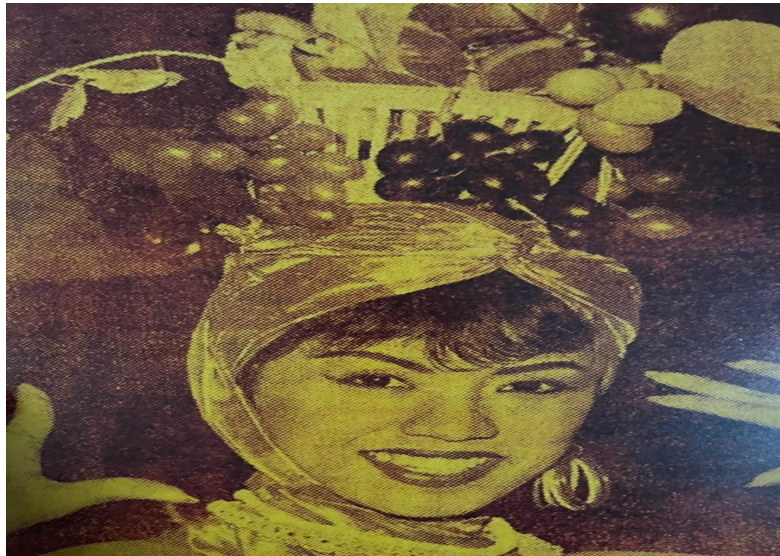
Figure 21: Saloma restyled the fruit headgear worn by Carmen Miranda in the film “The Gang’s All Here”

Clearly, the fashion designs as discussed in this paper had given shape to a more modern, stylish and trendy lifestyle for Saloma. Indeed, her lifestyle was modern and quite westernised. This was because Saloma was influenced by imperialism of culture and this brought about a huge impact at the height of her glory. It was seen that Saloma’s lifestyle was very progressive. The media in Malaya had often published images of Saloma who frequently wore sexy outfits similar to western artistes at the time. It was undeniable that the lifestyle practised by Saloma ran contrary to the norms practiced by the Malays who lived in in Malaya during the time. Her appearance in modern clothing, as seen in films and magazines, were regarded as immoral in the eyes of the Malays in Malaya at the time. This ultimately led to the local communities making the assumption that artistes like Saloma were immoral for not setting a good example for society (Hussin, 2004).