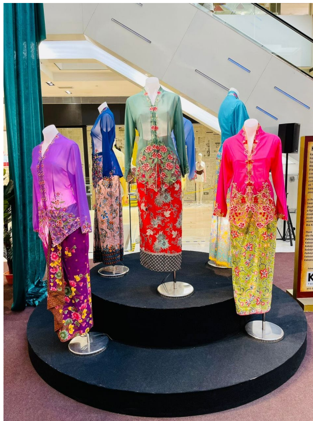
Figure 18: Kebaya Saloma had been on display at P. Ramlee and Saloma Aku, Dia dan Lagu Exhibition, Fahrenheit88 Mall, April-July 2022

of clothing had undergone a process of continuous development. Saloma had added value to the kebaya fashion when she made adjustments to the design based on her own creativity. Tight-fitting contemporary kebaya which she produced were made from printed polyester with bright blue hue and pink floral motifs. This kebaya design had a round-neck collar on the front with a v-shaped cut at the back. The zipper at the back which zips upwards was the main attraction of this kebaya. The finishing of this kebaya was done with hand-sewn stitches. Saloma had paired this kebaya with a seamless batik skirt of the 1950s and 1960s (Figure 17 & 18). Saloma's contribution to the country's fashion industry was seen to have been in a class of its own and served to inspire many contemporary fashion designers. In 2007, Dato' Seri Siti Nurhaliza brought back fond memories and nostalgia of Saloma's classic appearance by giving tribute to the contributions of P. Ramlee and Saloma to the local performing arts industry in a concert called " Konsert Istana Cinta, Nostalgia Tan Sri P.Ramlee & Puan Sri Saloma " (Figure 19) (Dato' Siti Nurhaliza, 2007). Although the fashion designs introduced by Saloma contained influences of western imperialism, the preservation of local fashion design and style demonstrated that local influences can never be displaced entirely by the British occupiers. In relation to this, Saloma was recognised as a national fashion icon.