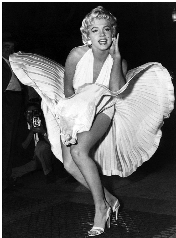
Figure 13: Marilyn Monroe also a subject of American Imperialism States in the 1950s and 1960s