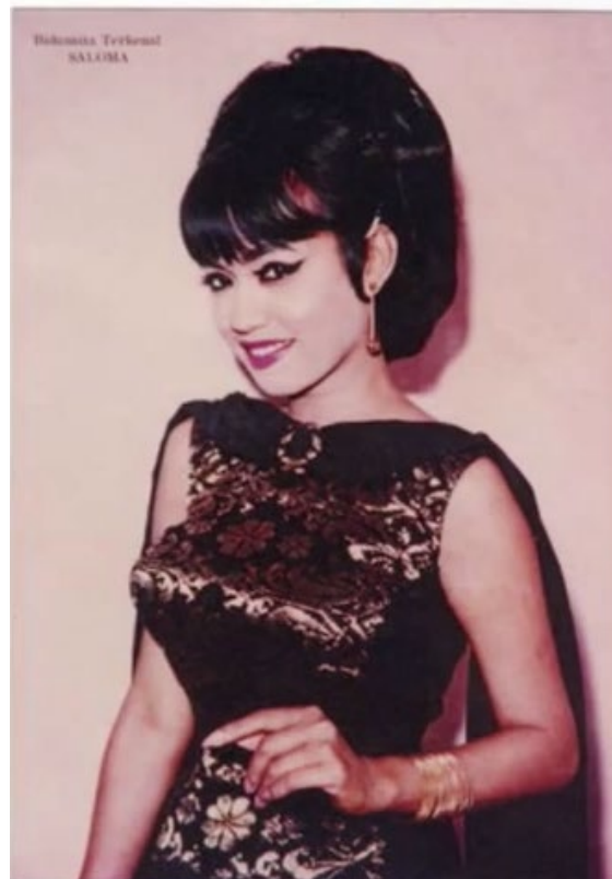
Figure 1: Saloma at the height of her glory