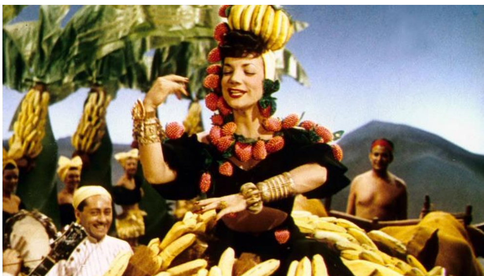
Figure 20: Carmen Miranda in the film “The Gang’s All Here” in 1943

Saloma was also daring enough to parade a fruit headwear (Figure 21) as was worn by Carmen Miranda in the film “The Gang’s All Here,” (1943) (Figure 20) (Mandrell, 2001). This costume was used in the film “ Saudagar Minyak Urat ” (1959). Aside from colour-block fashion, Saloma also created a unique fashion to display a 21-inch waist and exposing the top half of the chest. The peplum (tapered skirts) design, side-split skirts, and tight kebaya were introduced by her between the 1950s and the 1960s, which incorporated both eastern and western characteristics.