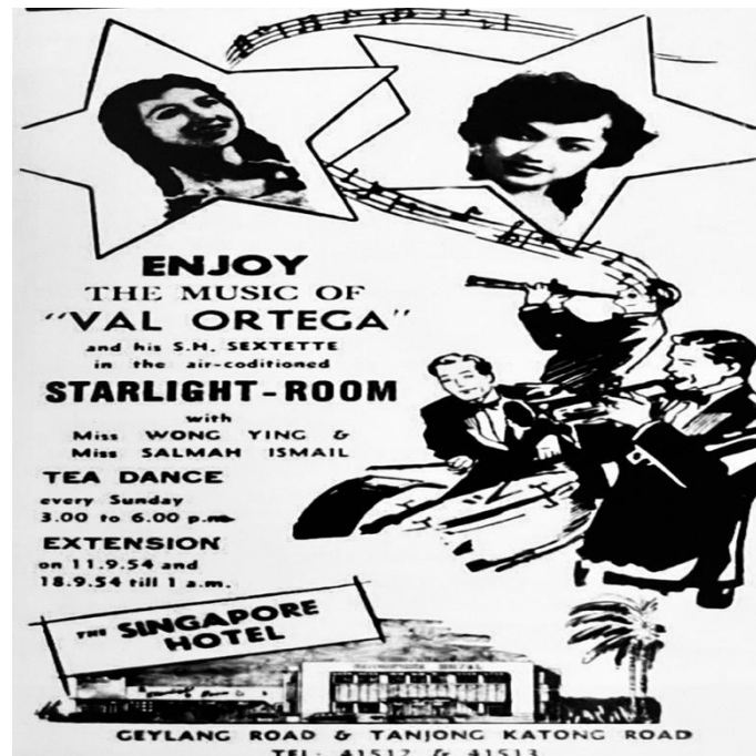
Figure 8: First advertisement of Salmah bin Ismail@Saloma as a Professional Night Club Singer in 1954