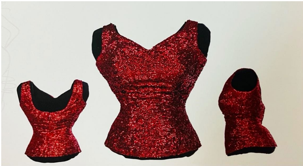
Figure 14: The tight-fitting short blouse decked with hand-sewn ruby sequins, with cotton as the base fabric, weighed 126 grams and was worn by Saloma in the 1965 film Ragam P. Ramlee when she rendered the song “Hancur Badan Dikandung Tangan”

advanced in aspects of fashion and her support for the western dressing style had significantly impacted the fashion industry in Malaya (Zakaria & Mohd. Yunus, 2017).