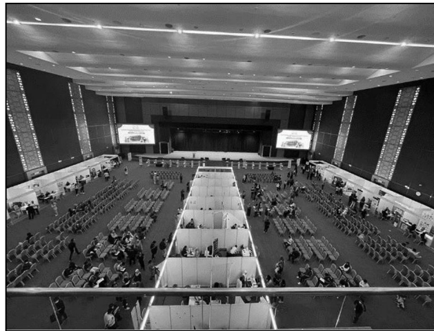
FIGURE 4. Layout inside the UTeM Chancellor's Hall

The career talk, a side event of the program, is scheduled for 31 May 2023, which is the second day of the program, and is held at the UTeM Lecture Hall Complex. This career talk has two sessions conducted by