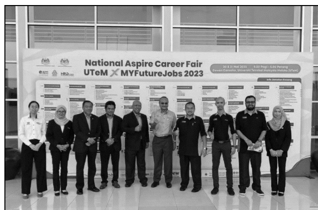
Figure 5: Group photo session with the visitor

A program requires regular revisions in strategic planning and scheduling of activities to stay competitive and ensure the learning environment remains conducive to optimal learning. These crucial activities must be strategically timed to strengthen the relationship between students and their surroundings, ultimately benefiting the entire community. Forty employers from selected companies participated in ASPIRE'23, where the companies are closely aligned with the courses offered by our university. Each company's representative utilized the provided booth to showcase their business. The interview with the visitor is also conducted in the booth. All visitors are allowed to join the career talk that is held at the UTeM Lecture Hall Complex.