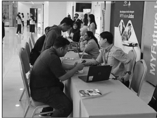
FIGURE 3. Registration Counter