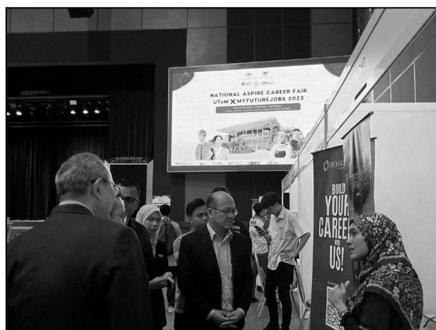
FIGURE 2. VVIP visited the booth

ASPIRE'23 is separated into a few parts, which are the opening ceremony of the program, the career fair exhibition, and the career talk. The opening ceremony of the program took place on 30 May, 2023 at the UTeM Chancellor's Hall. The event featured distinguished guests, including the Chief Minister of Malacca as the VVIP, along with VIPs such as the Vice Chancellor of UTeM, the Director of PERKESO, and the Director of HRD Corp. Additionally, Deputy Vice Chancellors of Student Affairs and Alumni (HEPA) from all public universities were in attendance. The ceremony commenced with a welcome speech by the Vice Chancellor of UTeM, followed by an address from the Chief Minister of Melaka, which officially inaugurated the National Aspire Career Fair 2023. The opening was further highlighted by a launch gimmick involving drones controlled by UTeM students, which burst a large balloon suspended in the centre of the hall. The balloon is filled with card names of companies that are involved in ASPIRE'23. Visitors who manage to grab the company card names will get the advantage of going to the company's fast-lane interview. The VVIP visited every booth before leaving the ceremony and presented appreciation souvenirs to all companies in recognition of their involvement.