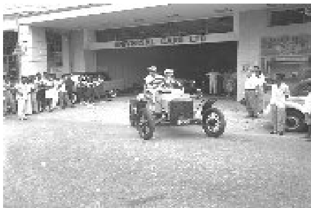
Figure 2: Wearne Brothers' 1909 Model Ford Genevieve in Singapore.

According to the Dodge brothers, Wearne became one of their most-prized agencies, while for Wearne, the Ford agency gave impetus to its automobile sales. 40 The agreement provided Ford the avenue it needed to break into the Malaya market. Wearne Brothers was made Ford's sole agent in 1911. From that point Wearne played an active role in promoting Ford cars in the Malayan market (see Figure 1).