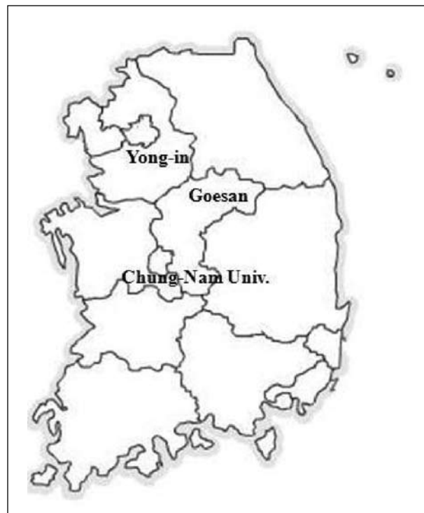
FIGURE 1. Korean map showing the location of the investigated sites along with the GPS coordinates viz. Site-I (Chung-nam University, 36° 22'031" N and 127° 21'226" E), Site-II (Chung-buk Geosan, 36° 49'341" N and 127° 46'144" E) and Site-III (Yong-in, 37° 20'816" N and 127° 14'772" E)

accumulated sites) but the textures of the overlying soils were different. South Korean map showing the location of investigated sites and their GPS coordinates is presented in Figure 1.