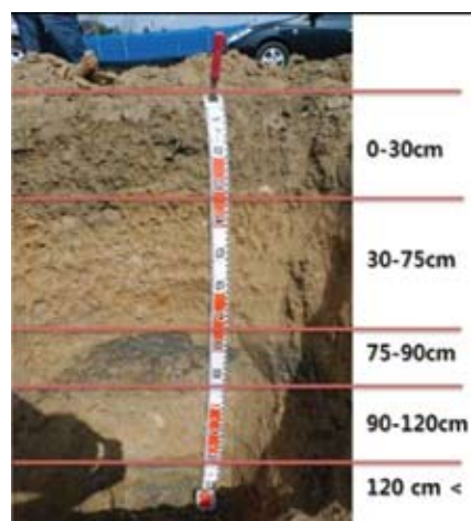
a. Site-I (Chung-nam University field )

The Site-I exhibited sharp increase in bulk density and it ranged between 1.47 Mg m -3 at 0-30 cm depth and 1.80 Mg