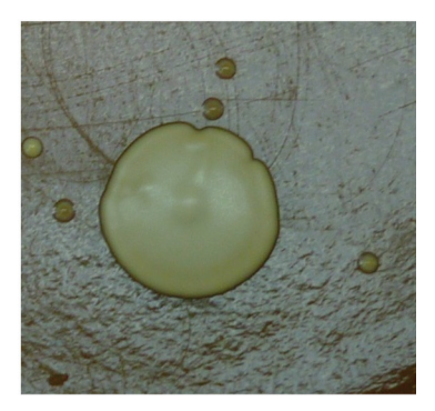
FIGURE 2. Culture morphology of the three strains of BLIS-producing Lactobacillus sp.