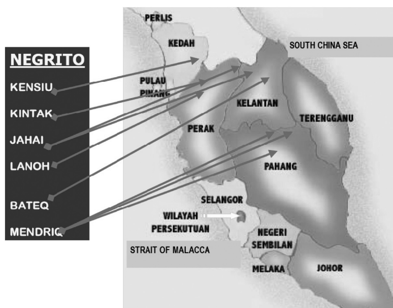
FIGURE 1. Negritos distribution in Peninsular Malaysia

Population screening was performed on 600 Negritos in three states of Malaysia including Kedah, Kelantan and Perak from November 2005 until August 2009. The Negrito samples were collected from five of its six sub-ethnicities due to high sub-group marriages in Mendriq. Samples from the Malaysian Malay, Chinese and Indian were collected and went through the same procedure as Negritos. At least, a three-generation pedigree is obtained to be sure that there are no mixed marriages. Informed consent was obtained