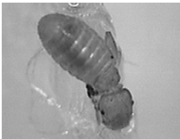
FIGURE 1. The psocid, Liposcelis bostrychophila Badonnel (Psocoptera: Liposcelidae) recovered from the insect box in entomology museum, IMR. (x40)

Liposcelis bostrychophila is an extremely difficult insect to control. Its small size enables it to hide in crevices