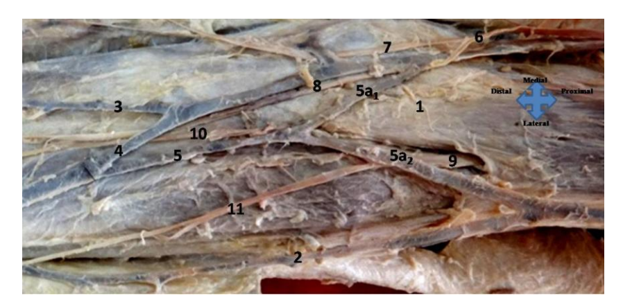
Figure 2 : Dissection of elbow region displaying cutaneous nerves related to superficial veins (1. Biceps brachii, 2. Cephalic vein, 3. Basilic vein, 4. Median cubital vein (MCV), 5. Ascending Cubital vein (ACV), 5a1. Medial tributary of ACV (MACV), 5a2. Lateral tributary of ACV (LACV)s, 6. Medial cutaneous nerve of forearm (MCNF), 7. Anterior branch of MCNF (AMCNF), 8. Posterior branch of MCNF (PMCNF), 9. Lateral cutaneous nerve of forearm (LCNF), 10. Medial branch of LCNF (MLCNF), 11. Lateral branch of LCNF (LMCNF))