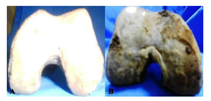
Figure 2: Photographs showing 2A-inverted 'U' shaped and 2B-inverted 'V' shaped intercondylar notches.

1-GH). The notch width index and notch depth index were calculated with these data. The width of the intercondylar notch was estimated as the distance between the medial prominence of the lateral condyle to the lateral prominence of the medial condyle. The ratio of femoral intercondylar notch width to the condylar width of femur was determined as the notch width index. The ratio of depth of femoral intercondylar notch to the depth of femoral condyle was determined as the notch depth index. All measurements were were performed by the same person and was observed by the other authors of the present study on each time the measurement was taken. The statistical analysis among the right femora and left femora were performed by the independent t-test, the difference was considered statistically significant if the p-value is less than 0.05. The statistical analysis was performed with the SPSS 15.0 version. The morphometric data of the present study were represented as mean ± SD. The measurements were compared statistically with respect to right and sides and were tabulated.