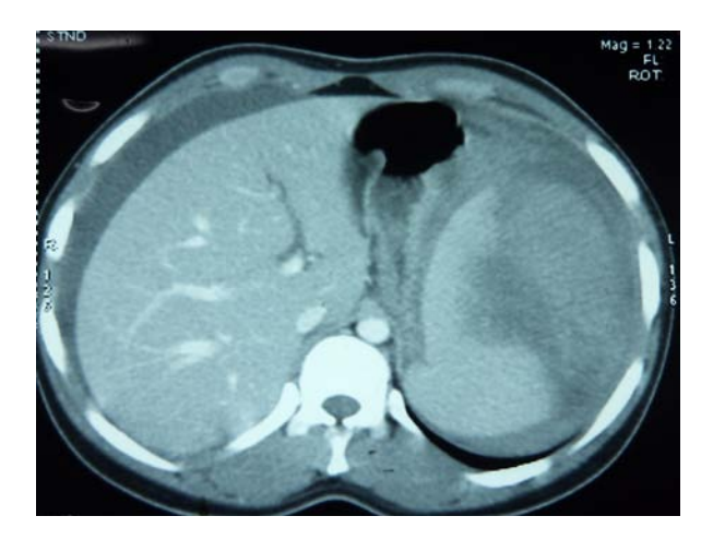
Figure 1: CT scan showing splenic rupture and haematoma with haemoperinoneum.

On imaging, FAST revealed, moderate fluid in peritoneal cavity with gross internal echoes. There was moderately enlarged spleen with irregular margins at the upper pole suggestive of hematoma. Contrast Enhanced Computerised Tomography CECT of the abdomen showed moderate splenomegaly having irregular margins of upper lateral part suggestive of subcapsular hematoma with significant free fluid present in perisplenic area and peritoneal cavity. (Fig. 1) Hematological investigations were suggestive of recent blood loss with Haemoglobin = 4gm/dl, (normal range 11-15 gm/dl) Total Leukocyte Count = 15, 200cell/cmm (normal range 4,000 – 11,000 /cmm) and raised reticulocyte count. Other laboratory parameters were within normal limits.