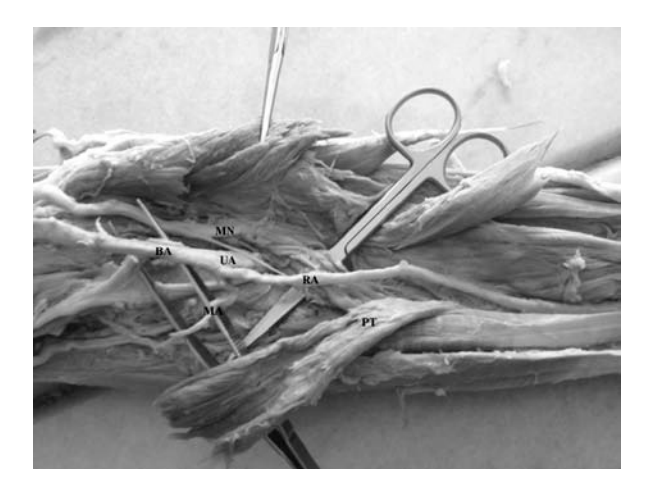
Figure 2 : Showing Brachial artery (BA) medial to biceps brachii muscle (BB), passing deep to median cubital vein (MCV) and superficial to bicipital aponeurosis (bap). The median nerve (MN) is seen medial to BA. The MN& the branches of BA are seen passing deep to pronator teres muscle (PM).

The superficial course of the right BA over the bicipital aponeurosis as observed in our case, predisposes the artery to traumatic injuries in the cubital region leading to ischaemia of forearm which can be easily missed in presence of extensive collateral circulation (14). An intended intra-venous injection into the median cubital vein for blood sampling or