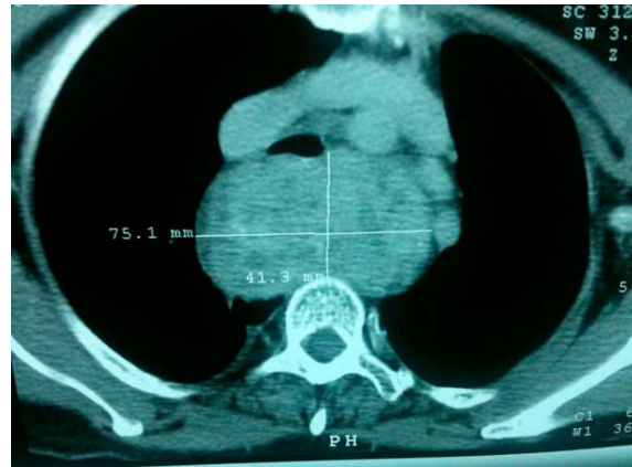
Figure 2: CT scan showing the posterior location of the retrosternal thyroid