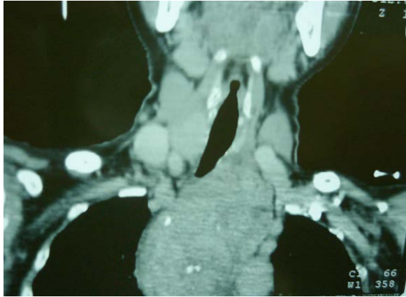
Figure 1: CT scan of the neck showing the left retrosternal extension.