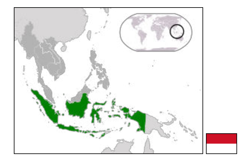
Fig 1. Location of study

As the world's third most populous democracy Indonesia's current issues include consolidating democracy after four decades of authoritarianism, holding the military and police accountable for human rights violations, reforming the criminal justice system, stemming corruption, implementing economic and financial reforms, alleviating poverty, improving education, preventing terrorism, addressing climate change, and controlling infectious diseases, particularly those of global and regional importance.