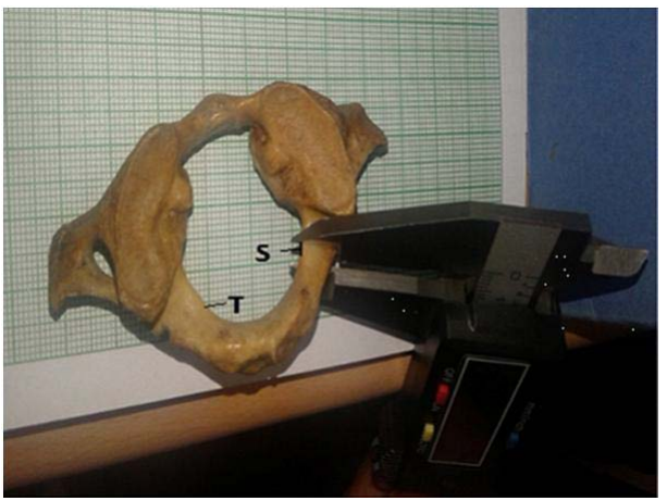
Figure 2 : Different parameters studied on each atlas vertebra (S-Thickness of posterior arch at the site of vertebral artery groove-Right; T-Thickness of posterior arch at the site of vertebral artery groove-Left)