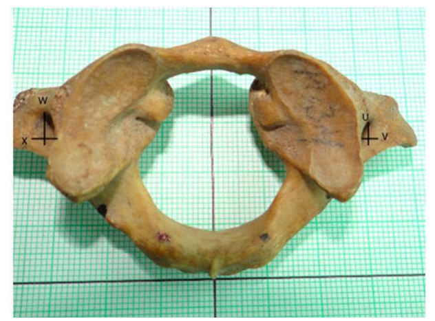
Figure 3 : Different parameters studied on each atlas vertebra (U-Foramen transversarium Antero posterior diameter –Right; V-Foramen transversarium Transverse diameter –Right; W-Foramen transversarium Antero posterior diameter –Left; X-Foramen transversarium transverse diameter –Left)